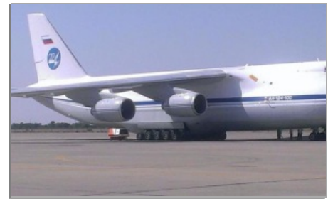
Govt Releases Cargo Plane Seized in Nigeria